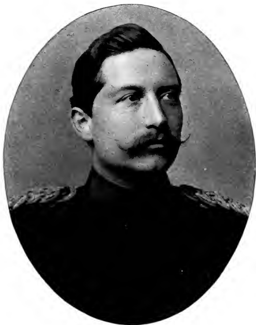
THE EMPEROR IN THE YEAR OF HIS CORONATION, 1888